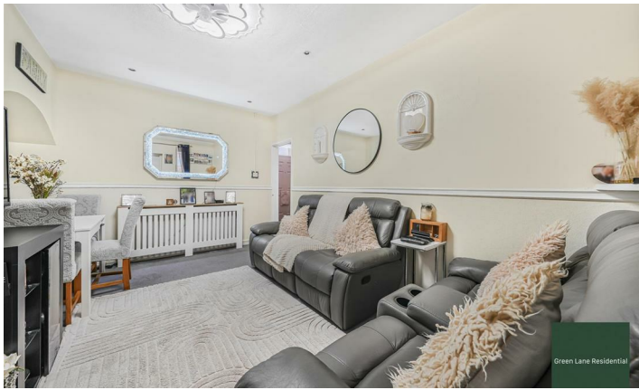
Green Lane Residential