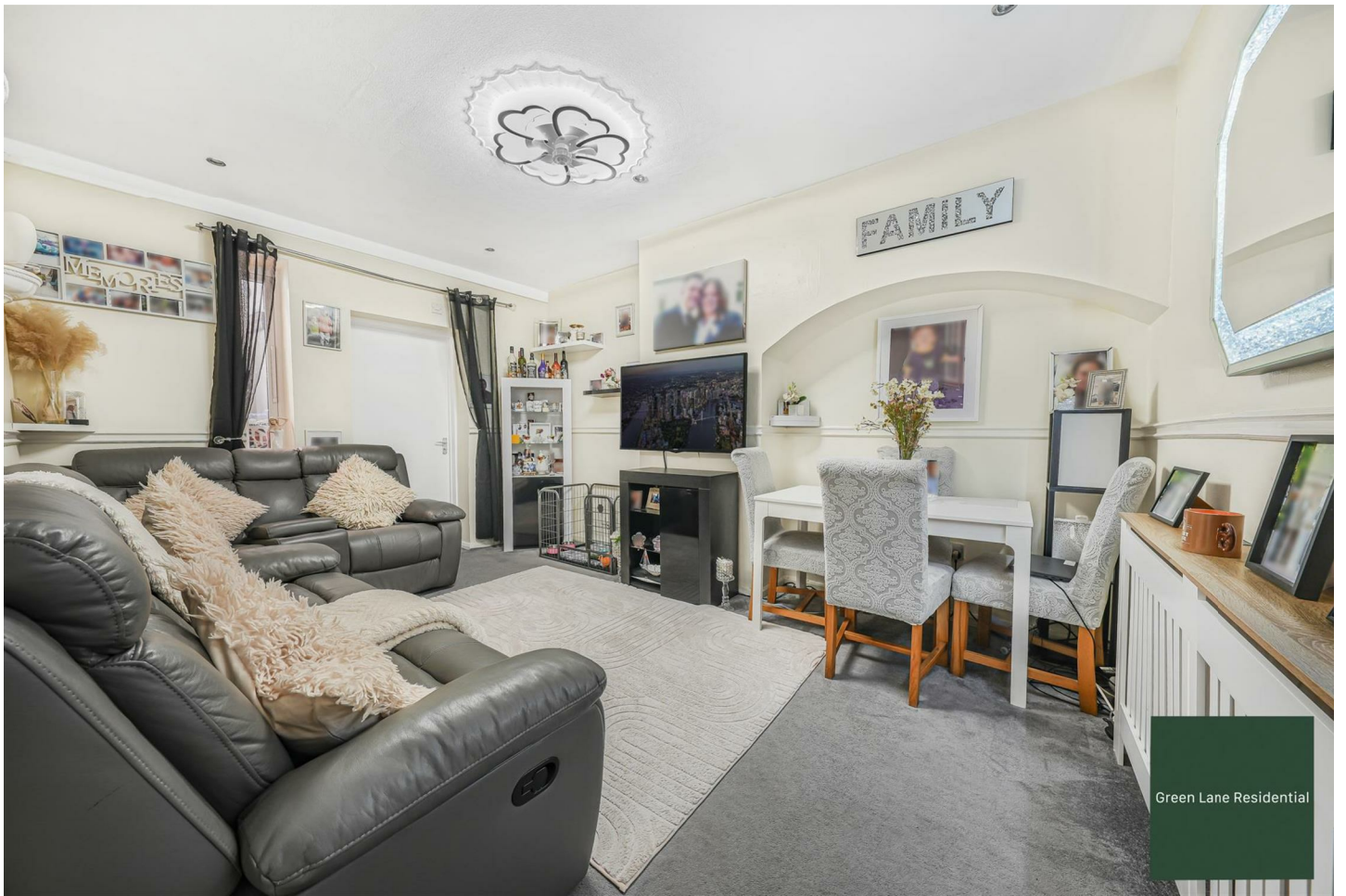
Green Lane Residential