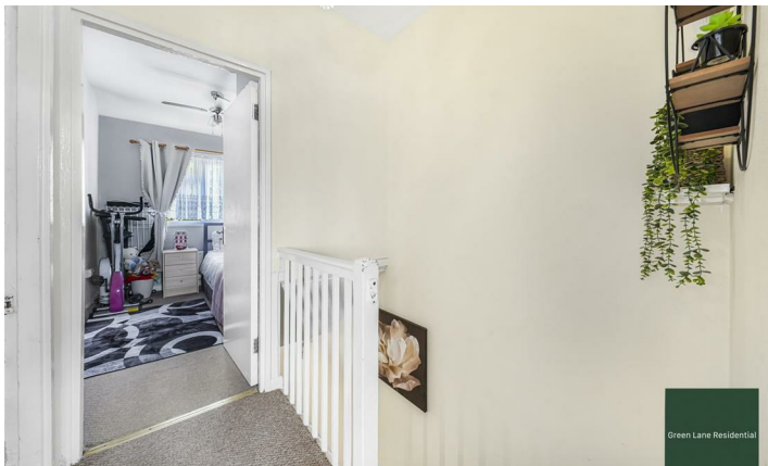
Green Lane Residential