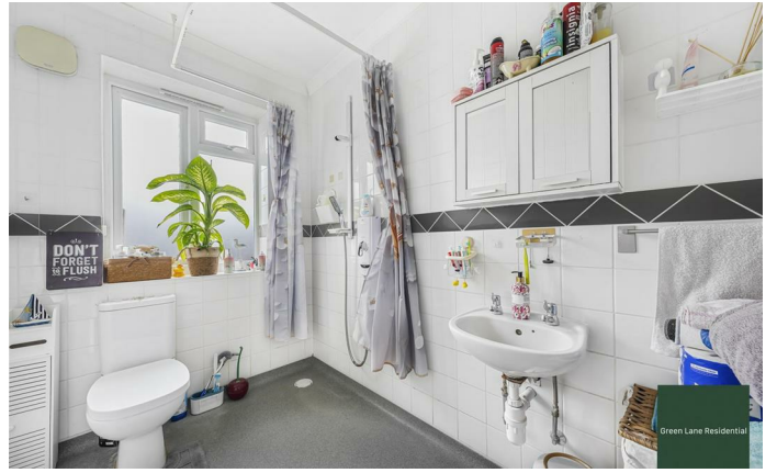
Green Lane Residential