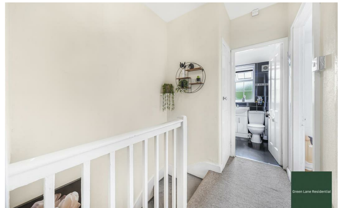
Green Lane Residential